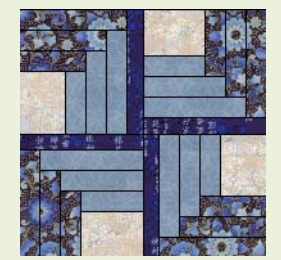
May Block - Log Cabin with a Twist

This block is from the Better Homes and Gardens Creative Collection: 100 Quilt Blocks, Spring 2007.